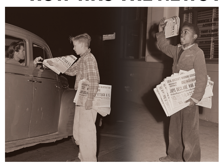
Newsboys in Redding, California, selling extra editions of The Searchlight newspaper. The headline reports the Japanese attack on Pearl Harbor on December 7, 1941.