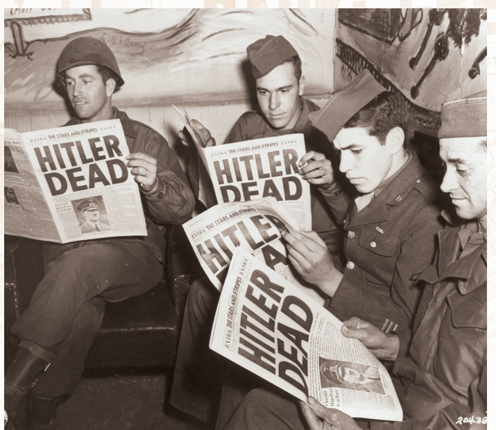
American soldiers read of Hitler's death in an "extra" edition of Stars and Stripes, 1945.

Letters to the editor from community members, who often wrote to react to the news or to support or oppose previously published editorials